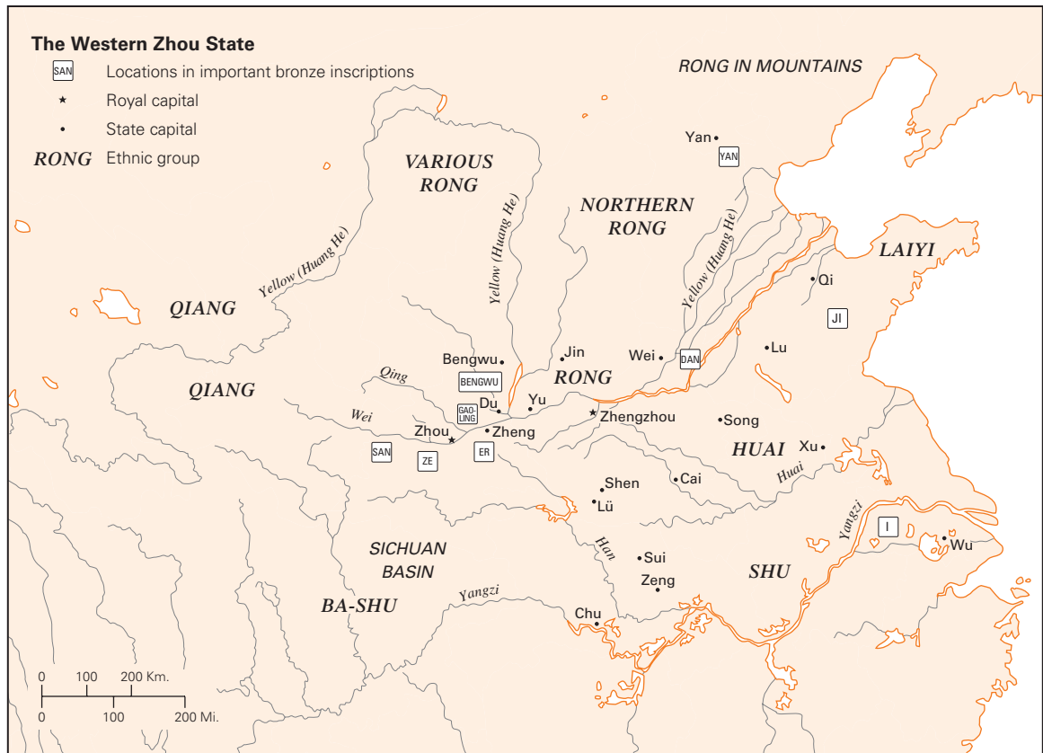
Map 1.1 Western Zhou China